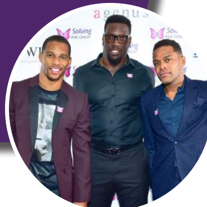
VICTOR CRUZ, JASON PIERRE-PAUL, MAXWELL